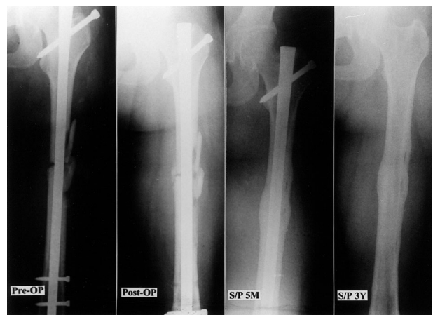
Fig. 3 Case 39 A 36-year-old man sustained a left middle third femoral shaft fracture and was treated with closed static locked nailing at a local hospital. Nonunion occurred for 1.5 years and exchange nailing with a Kuntscher nail was performed. The nonunion healed uneventfully within 6 months.

Complications included three aseptic nonunions (8.3%). All three patients were followed-up only because no symptoms were noted and they hesitated to have further operations. There were no wound infections or malunions (angulation > 10 degrees, rotation > 10 degrees or shortening > 2 cm) noted.