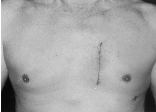
Fig. 3 Good cosmetic healing of the left parasternal minithoracotomy incision

tions and mediastinal lymph nodes dissections can be performed without difficulty. Our previous experience with minimally invasive thoracic and cardiovascular surgery indicates that it is expedient and safe with minimal discomfort, less postoperative pain, quick functional recuperation, excellent cosmetic healing, and shortened hospital stays, thereby decreasing costs (Fig. 3). (3,7-9) Hence, a minimal access approach to perform concomitant CAD and resectable lung cancer was attempted. The major advantages of concomitant operation via a minimally invasive approach include omitting the sternotomy and posterolateral thoracotomy, without compromise of essential procedures and adequate results. Thus, a minimally invasive procedure per se can reduce the incidence of postoperative mediastinitis and decrease wound pain. (10) One limitation of the left parasternal approach is poor exposure for pulmonary resection in patients with CAD with right lung cancer.