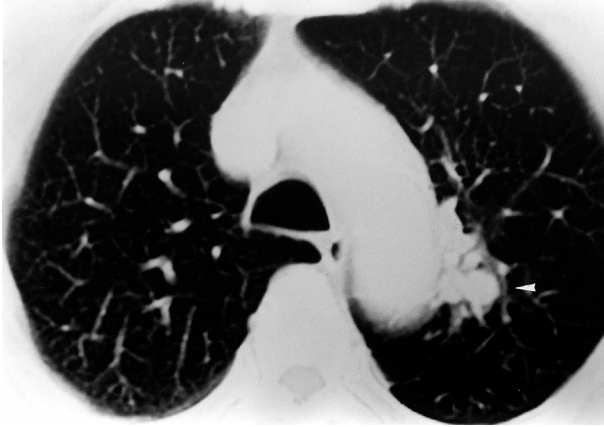
Fig. 1 Computed tomography demonstrates a periaortic nodular lesion at left upper lung (arrow head) with surrounding lung infiltration.